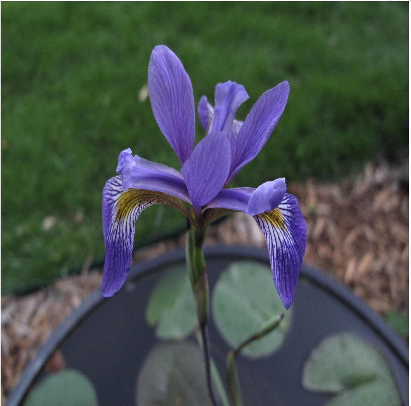
Iris versicolor 'Purple Flame.'

The rest of the story is illustrated in pictures – Iris versicolor 'Purple Flame,' 2022.