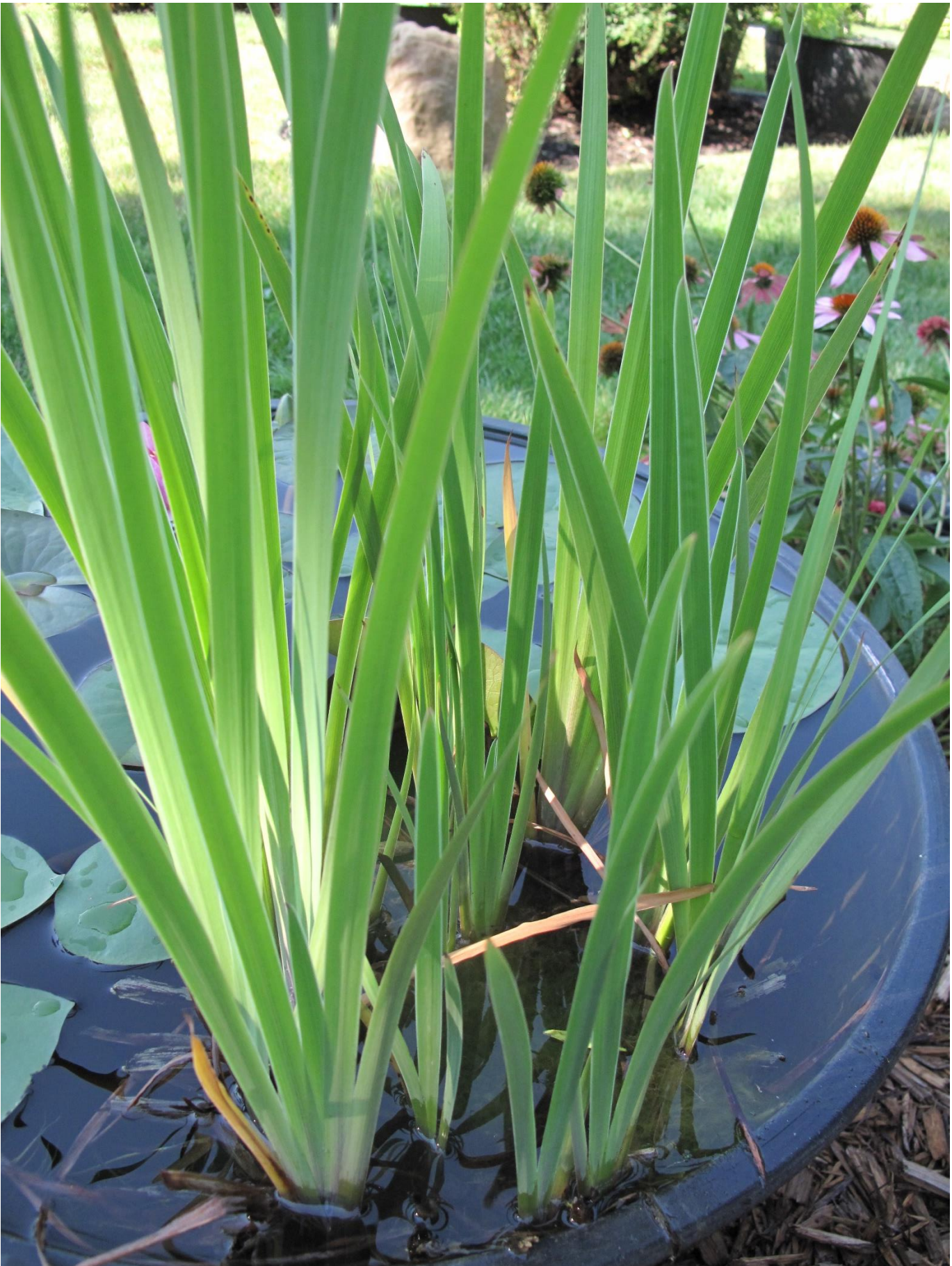
Early August and the foliage is now green. Rhizomes filling the container, time to divide.