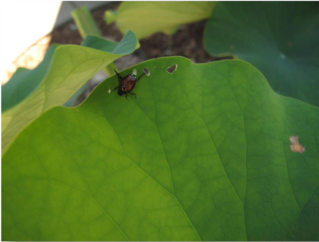
Impatient for the first lotus bloom to open, a beetle passes the time nibbling on a thick lotus pad.