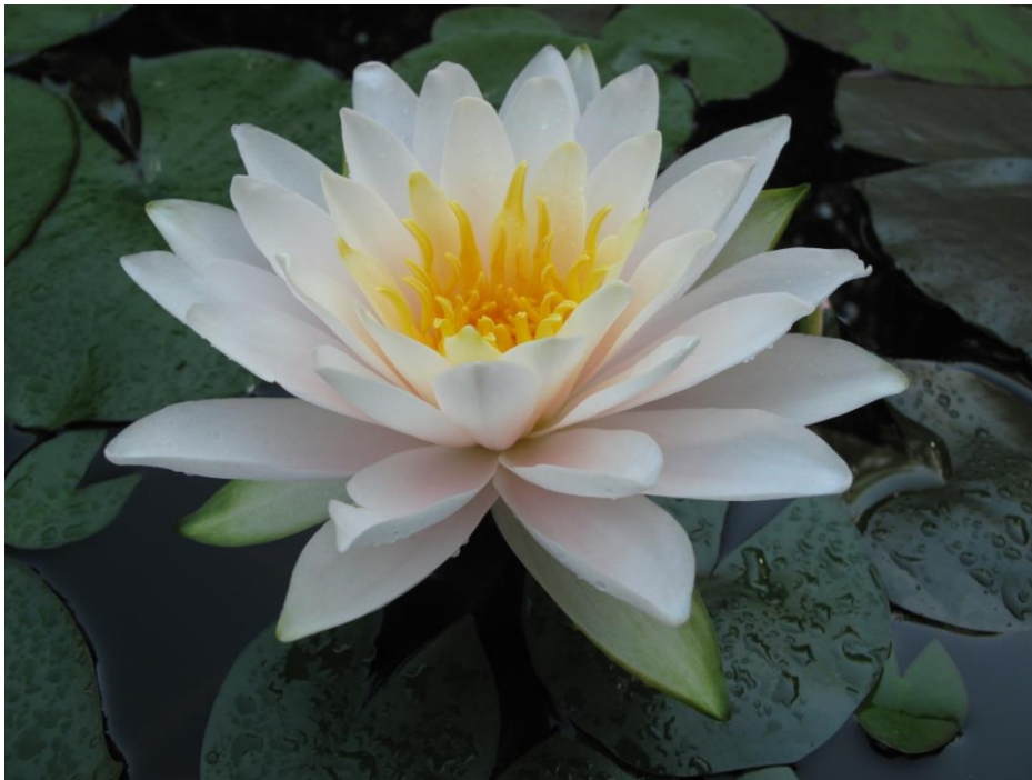
Nymphaea 'Marliac Carnea' without the Japanese beetles

Nymphaea 'Marliac Carnea' with beetle damage. Each summer, fewer than dozen waterlily flowers will be visited by the beetles. Because each waterlily produces lots of blooms each season, a summer's worth of blooms are not destroyed. Different story with the lotus. Each lotus has only two to six flowers a season and the bloom time is the two-plus months that the beetles are out. Some summers are worse than others. In my yard, this is the worse summer to date.